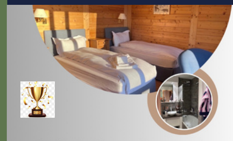
Daily Bedroom Expectations