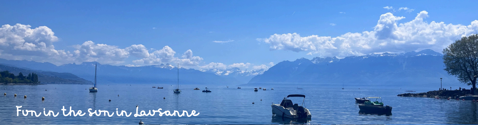
Fun in the sun in Lausanne