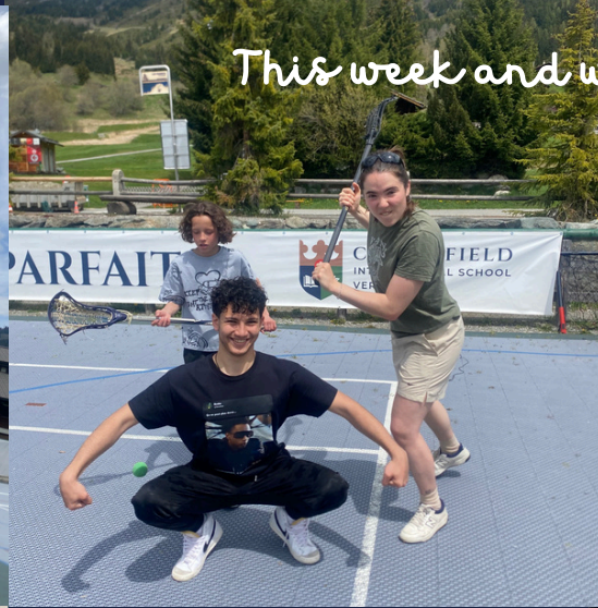
This week and weekend's activities