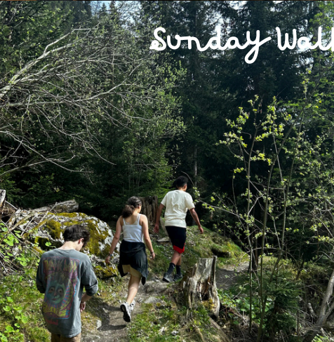
Sunday Walk with Sho